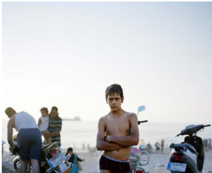
George Awde, His Passing Cover (2014)

As part of this year's Shubbak Festival, which brings the best of contemporary Arab culture to London, The Mosaic Rooms is launching a group exhibition exploring the work of a number of emerging artists that have a personal or professional connection with Beirut.