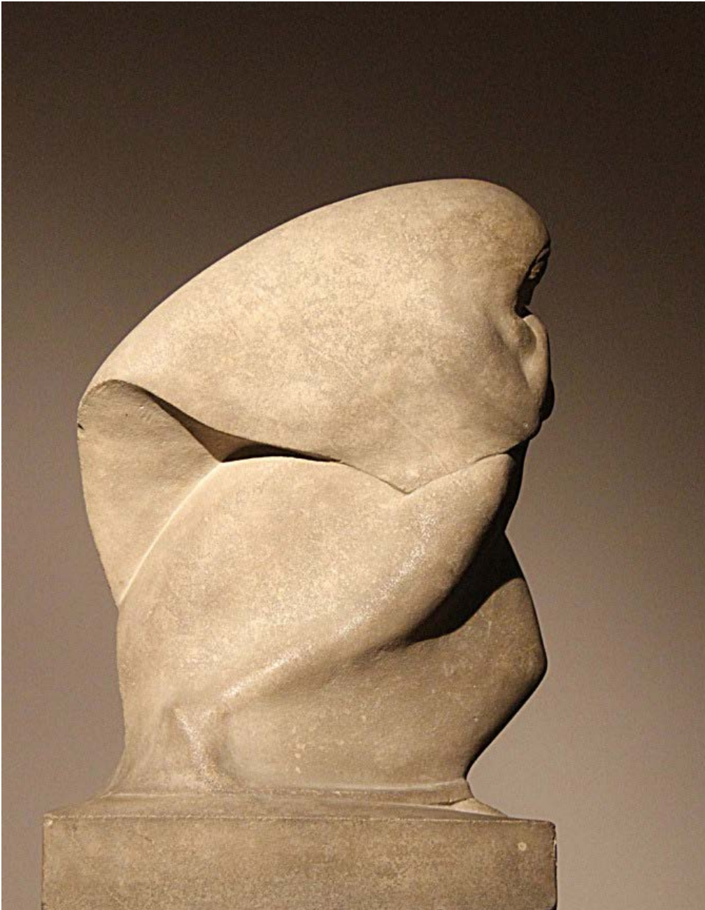
MAHMOUD MOUKHTAR , Khamasin Wind , 2012 replica of 1929 original, white stone, 57 × 41 × 21 cm.